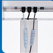
Waterproof connection for RS-232C & power adaptor