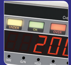
Bright coparator lights for checkweighing