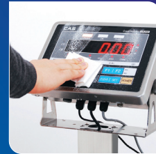
Waterproof (IP67) indicator