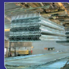
Modular Design with galvanized structure